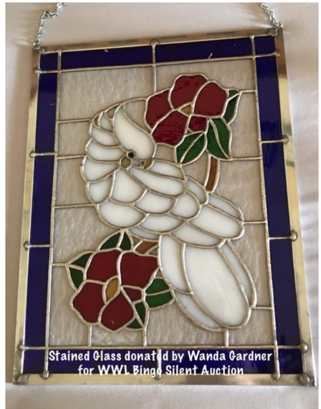
Stained Glass donated by Wanda Gardner for WWL Bingo Silent Auction