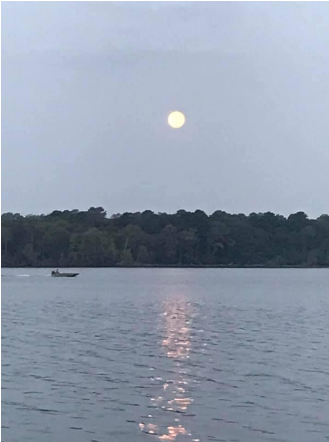
Full Harvest Moon