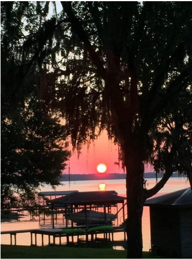
Sunrise on Bayhill Dr.