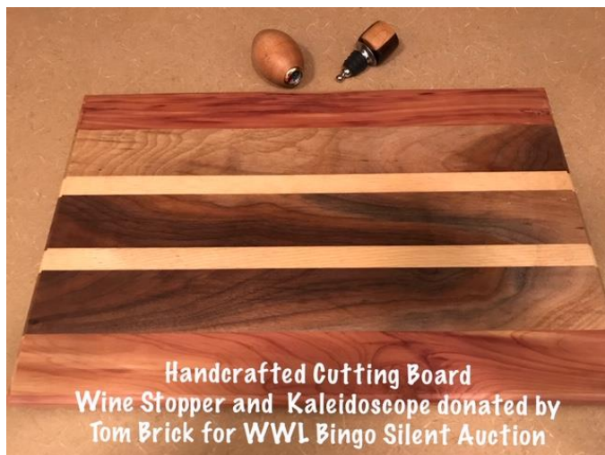
Handcrafted Cutting Board Wine Stopper and Kaleidoscope donated by Tom Brick for WWL Bingo Silent Auction