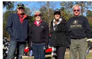
FIVE FABULOUS TEAMS! TEAM BRICK/BROWN/TURCHI PLACED 1ST