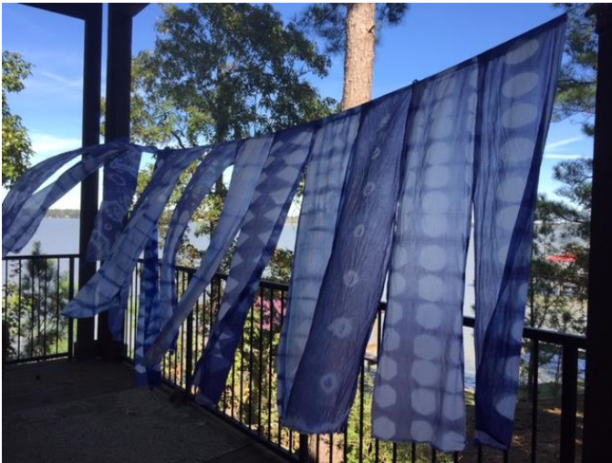
Lovely scarves made by Women’s League Ladies