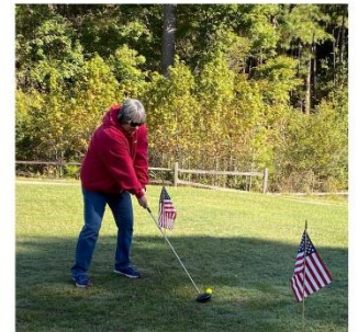
A BEAUTIFUL DAY FOR HALLOWEENIE!