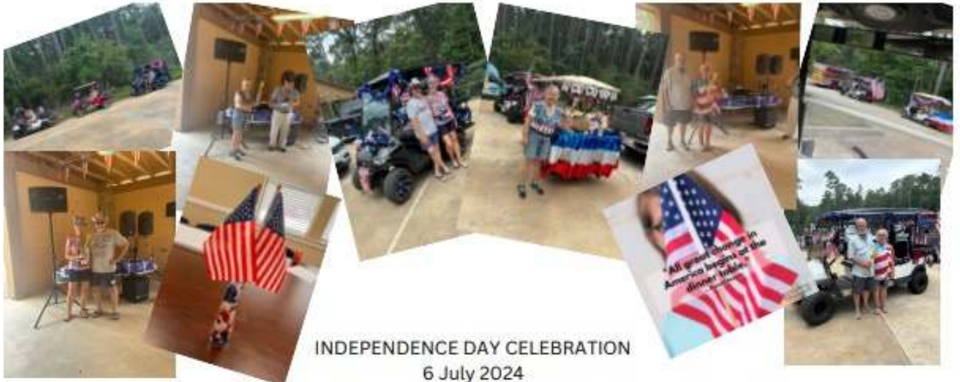
INDEPENDENCE DAY CELEBRATION 6 July 2024