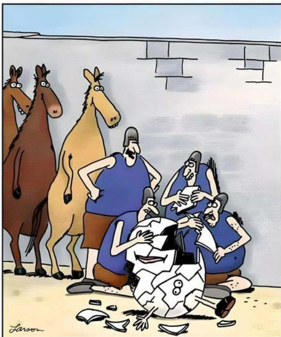
"Okay, okay, you guys have had your chance—the horses want another shot at it."