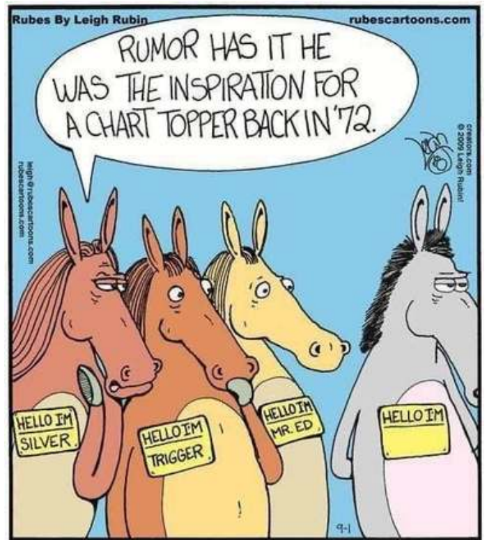
Celebrity horse mixers

Not my circus, not my monkeys. But I definitely know the clowns.