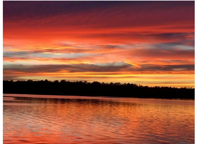
Sunset