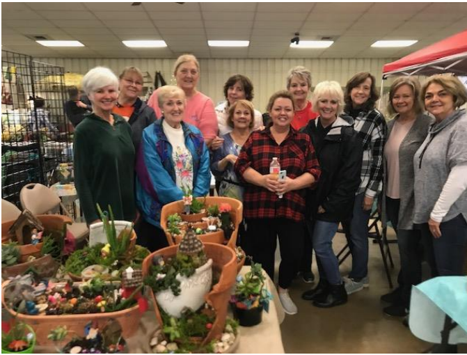
Waterwood Women at the Walker County Fairgrounds