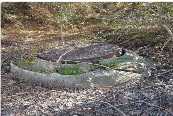
Figure 1 Manhole

There have been several rumors that have surfaced regarding bonds and taxes being raised. The Board has been looking at funding options for some upcoming projects that are required in Waterwood. At this point, we are only exploring the options and will involve the community when a viable plan is being considered. You can rest assured that economic impact on the community will be heavily weighed. Our water and wastewater systems have been in the ground for over 40 years and are reaching the end of their useful life, other than the wastewater treatment plant that is about 5 years old. The attached picture is an example of the condition of much of our system.