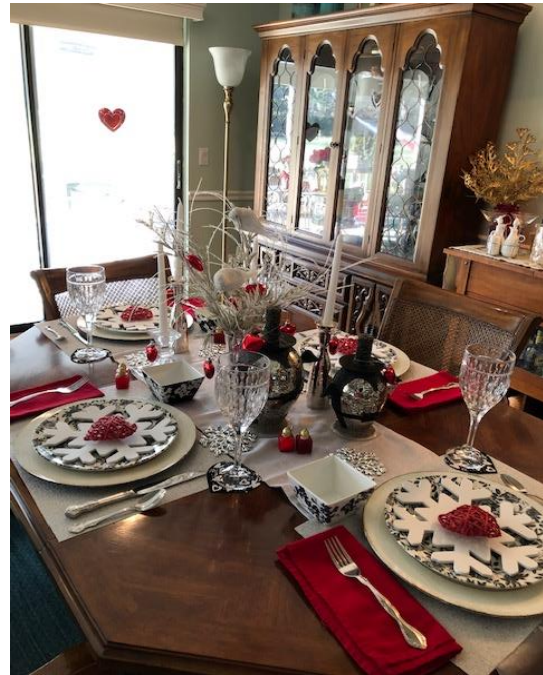
Beautiful Valentine's Day table setting at Shirley Morrell's home.

How is this even possible? Valentine's Day without Sweethearts Candies? I guess we will have to verbalize our true feelings! What a concept! Texting not allowed!