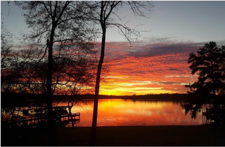
Sunset