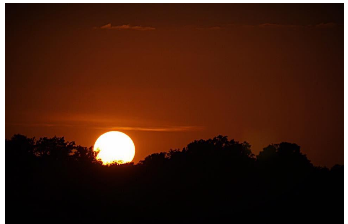
Sunset