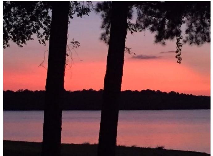
Sunset