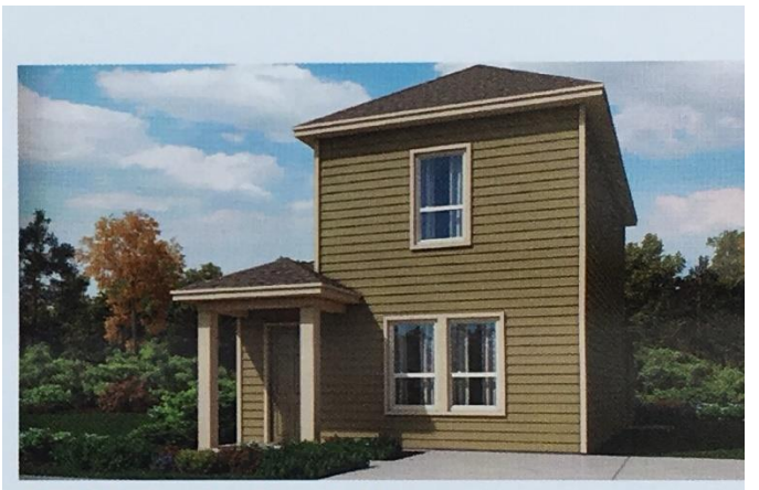
28201 Pools Creek Way Huntsville, TX 77320

Tiffany 900 sq. ft. 3 Bedrooms / 2 Baths Utility Room, Open Concept, Living Room/ Family Room, Gourmet Galley Kitchen, Master Suite in Rear of Home, Front Porch Area