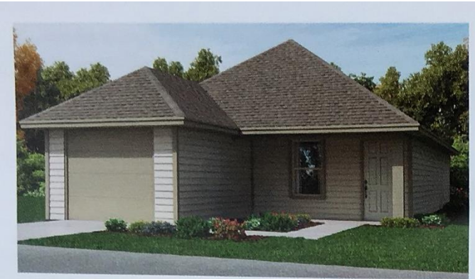
28801 Pools Creek Way Huntsville, TX 77320

PLAN 1125 1,125 sq. ft. 3 Bedrooms / 2 Baths/ 1-Car Garage Utility Closet, Open Concept, Large Living Room/ Family Room, "L" Shaped Kitchen