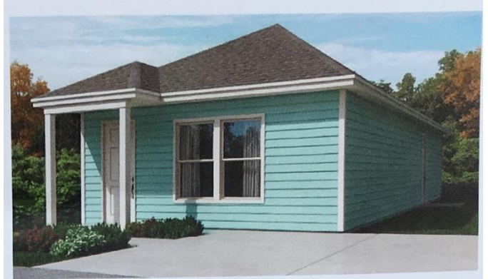
28401 Pools Creek Way Huntsville, TX 77320

Tiffany 900 sq. ft. 3 Bedrooms / 2 Baths Utility Room, Open Concept, Living Room/ Family Room, Gourmet Galley Kitchen, Master Suite in Rear of Home, Front Porch Area